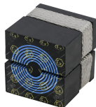
CX BG™ module with Multidiameter™